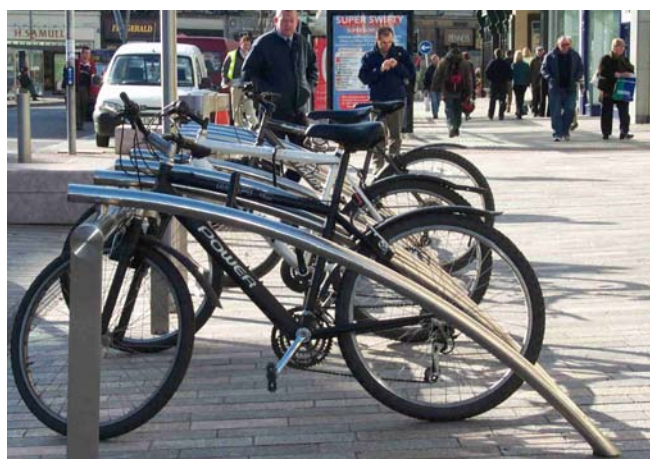
Stands on Saint Patrick Street